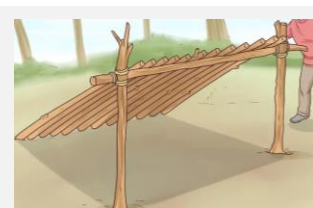
The Lean To

3 Medium sticks form a strong tripod shape.