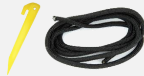
Tent Pegs and string