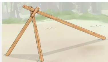
The "A" Frame

You can just let the group use their imagination – but if they need a bit of help knowing what a den could look like then these are some examples of den frames – you can use the shelter sheets (or sticks and leaves) to complete the shelter.