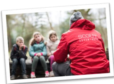
Welcoming groups to centre

If you have an interest or skill then we try to give you the opportunity to use it. We also like volunteers to be creative and leave their mark on the centre. In the past volunteers have painted climbing walls, built team building bases, and created vegetable gardens.