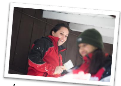
Improving the centre