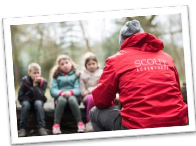
Welcoming groups to centre

If you have an interest or skill then we try to give you the opportunity to use it. We also like volunteers to be creative and leave their mark on the centre. In the past volunteers have painted climbing walls, built team building bases, and created vegetable gardens.