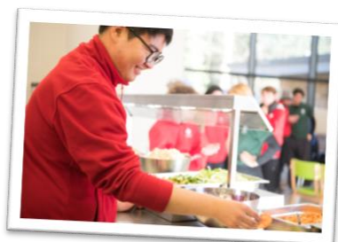
Helping with Catering