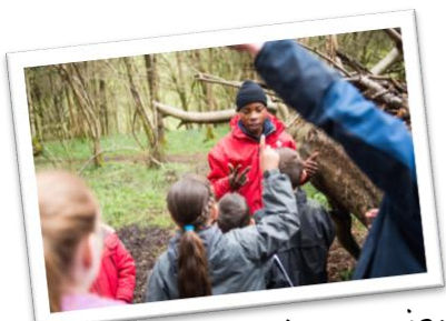
Instructing Activity sessions